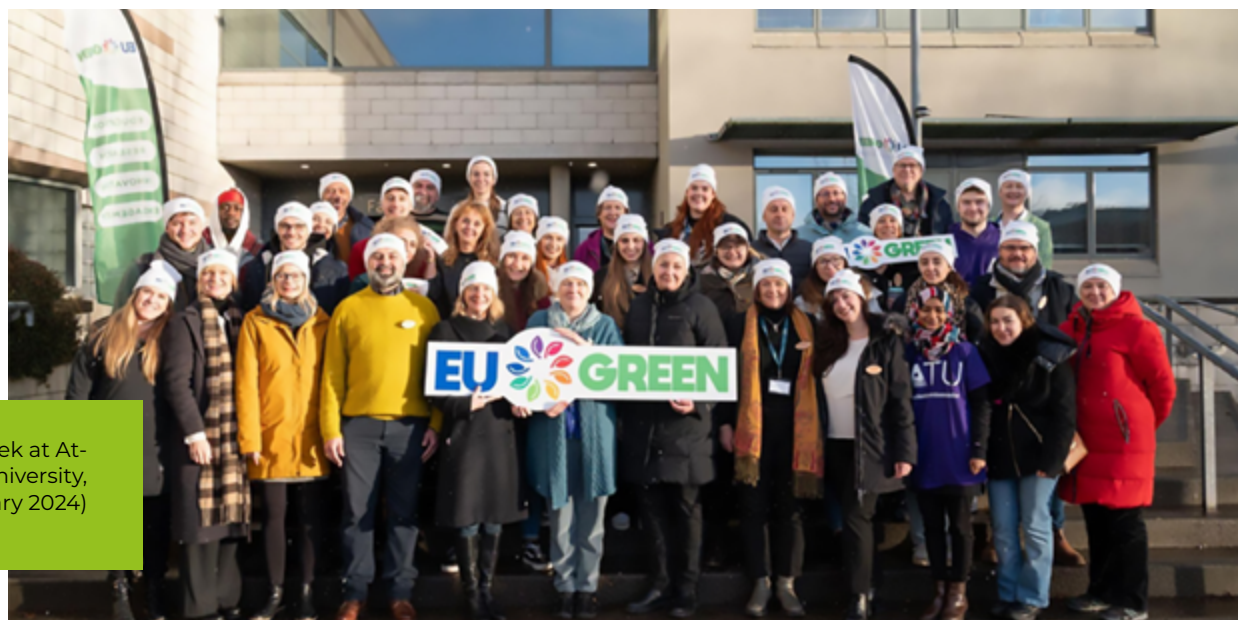
Attendees at Staff Week at Atlantic Technological University, Ireland (January 2024)