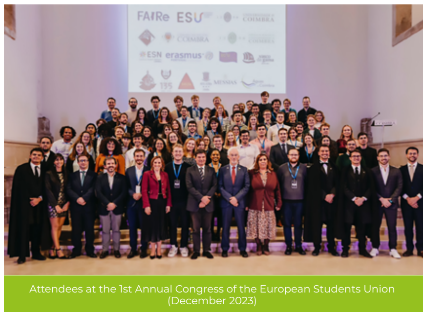
Attendees at the 1st Annual Congress of the European Students Union (December 2023)

and networks. For example, in December 2023, the annual congress of the European Students Union took place in Coimbra (Portugal). This meeting is an example of the involvement and proactivity of our Student Council, that represented the alliance in this European initiative.