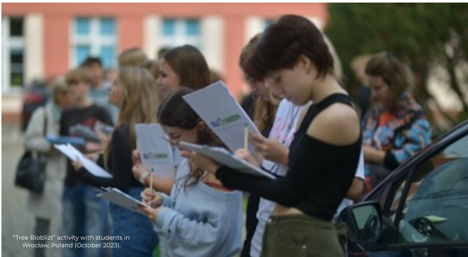
"Tree Bioblitz" activity with students in Wrocław, Poland (October 2023).