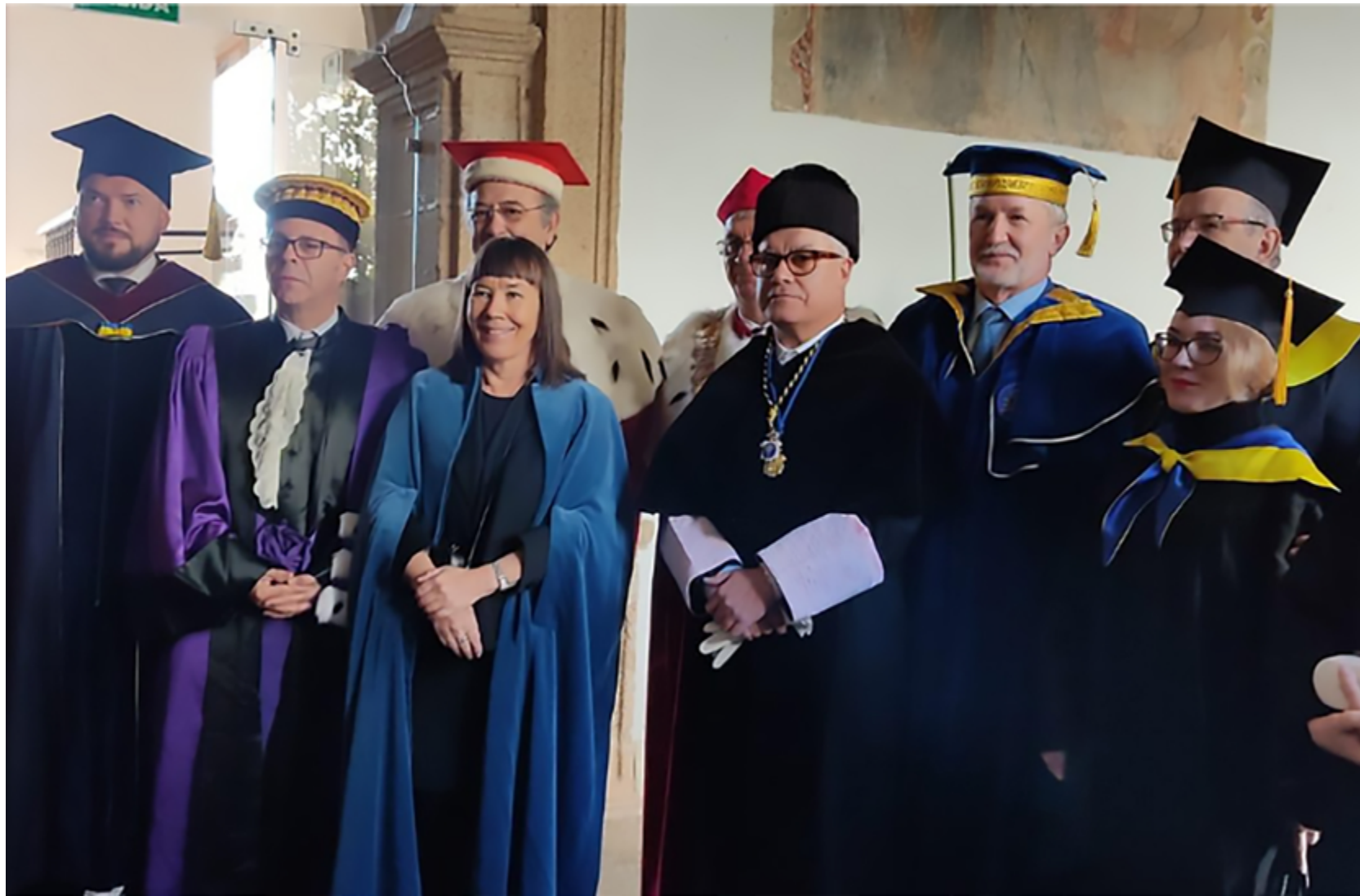
EU GREEN rectors attend the St. Thomas event as part of the launch meeting of the alliance at the University of Extremadura (January 2023).