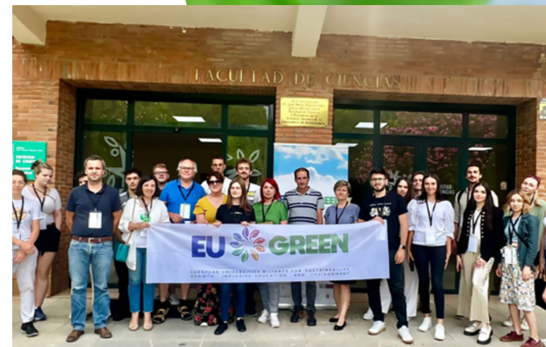
Attendees of the first Blended Intensive Programme organised at UEx in coordination with several universities of the alliance (June 2023)