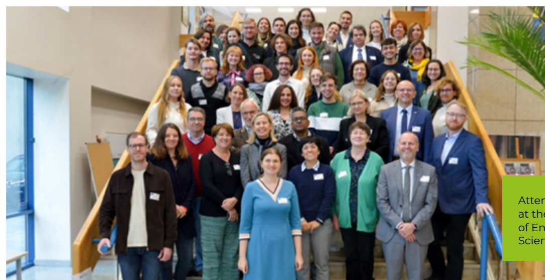
Attendees of the Staff Week at the Wrocław University of Environmental and Life Sciences, Poland (October 2023)