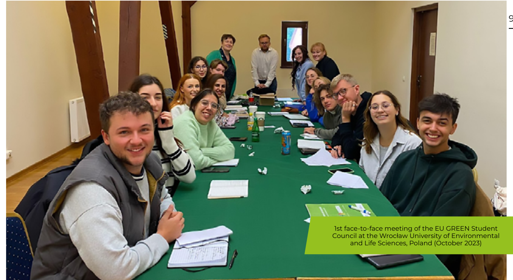
1st face-to-face meeting of the EU GREEN Student Council at the Wrocław University of Environmental and Life Sciences, Poland (October 2023)

“As a senator and student council member actively engaged in the European Universities Alliance EU GREEN, I believe in the transformative power of inclusive collaboration. Together, we are weaving a narrative of progress within the very fabric of our nine academic institutions. In my role as a student representative dedicated to the realization of a truly sustainable and healthy campus, I am convinced that our joint efforts today will shape the educational landscape of tomorrow. Let us cultivate an environment where varied perspectives and backgrounds enrich the learning experience, and where our collective responsibility extends beyond academics to leave a lasting, positive impact on our planet.”