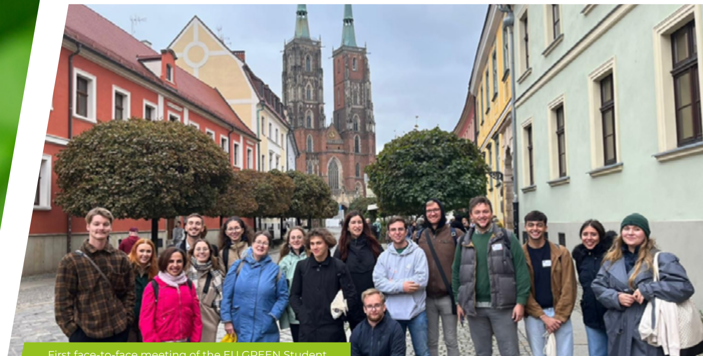
First face-to-face meeting of the EU GREEN Student Council at the Wrocław University of Environmental and Life Sciences, Poland (October 2023)