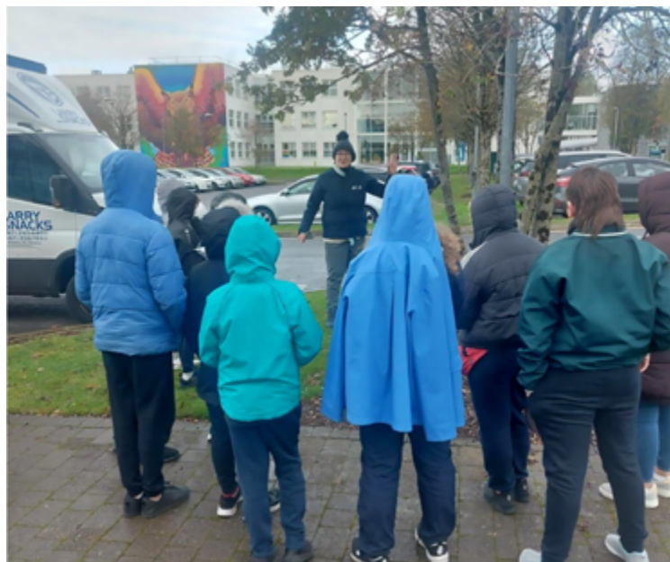
Tree Bioblitz activity with school students in the city of Sligo, Ireland (October 2023).

Throughout the week of 9 October 2023, all nine EU GREEN universities held an amazing Tree Bioblitz. Groups of school children from each of our nine countries catalogued the trees on each EU GREEN campus with the help of our alliance's ecologists, family members and some primary school teachers. The trees on the campuses' grounds were recorded using the iNaturalist application. The experience was a success and all participants enjoyed this rich initiative.