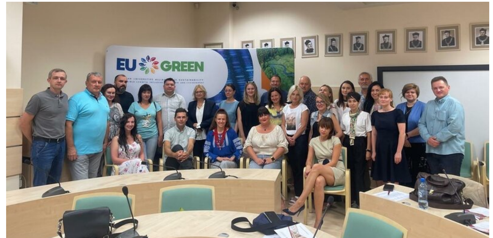
Attendees at the Wrocław University of Environmental and Life Sciences in the framework of the INTERACT project, Poland (September 2023)