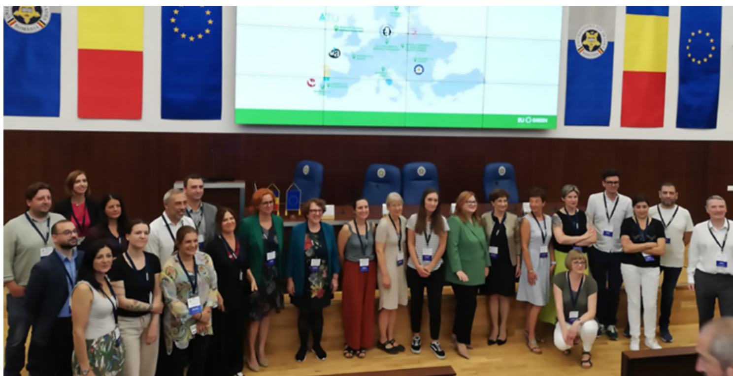
Attendees at Oradea University Staff Week, Romania (September 2023)

One example is the parity that is prioritised in the governance structure. As our president is a rector, our vice-president is the rector of the University of Gävle, Sweden. In the Senate, the presidency is held by a female professor, and the vice-president is a male professor. Among the Student Council, this parity criterion has also been respected.